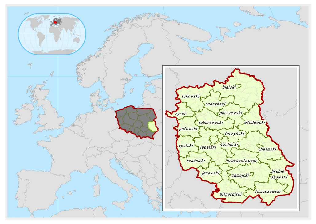
Fig. 1. Lubelskie region and its division at NUTS 4 (powiat) level.

environmental friendliness (iLUC neutral agricultural biomass) of biogas sector in Poland. Spatial data are used to ensure a bottom up modelling capacity since the daily supply of biogas plants has to be secured, an important element for location decisions. The economic potential of the system is estimated under resource competition conditions, where profit maximization is the driver of different players acting in the system, namely farmers and industrial partners. Building upon the existing literature, we set a decentralized decision-making framework, taking simultaneously into account the agricultural sector structure, the technology state-of-the-art and the current institutional setting related to biogas production. This is made possible by means of a partial equilibrium model that simulates the agricultural and the biogas sector interactions, estimating market clearing prices and quantities derived at the intersection of supply and demand. With this approach we aim to set up a tool to support the policy decision process concerning biogas production in Poland. As described in the next sections, through the examination of alternative incentive systems and operational constraints, it is possible to assess efficient policy suitable for the biogas industry take-off, estimating, at the same time, the optimal number, size and location of biogas plants.